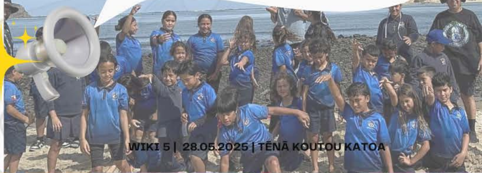
WIKI 5 | 28.05.2025 | TĒNĀ KOUTOU KĀTOA

5.3 HE MEA WHAKAIHIIHI I TE TAMAITI TE NOHO O TE PAKEKE KI TŌNA TAHA HEI TOKO MŌNA I ROTO I ĀNA MAHI. HEI ANO, KO TE ĀWHINA KO TE TAUTOKO I A IA. ENGARI KIA KAUA E RIRO MĀ TE PAKEKE E MAHI TE MAHI Ā TE TAMAITI.